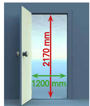
Minimum sizes of the doors / passages