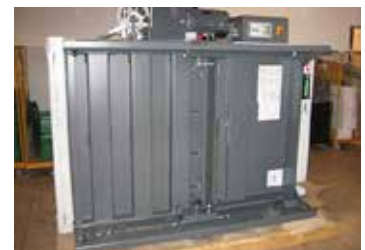
Delivery of the lying machine: Dimensions of the pallet = 2200 x 1300 mm